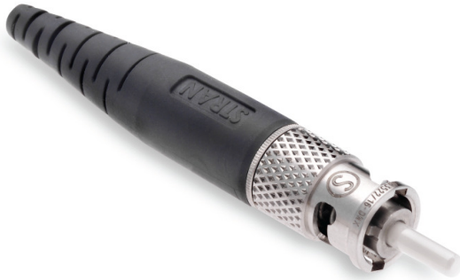
MIL-C-83522/16-DNX ST Connector

STRAN Technologies' MIL ST connectors and adapter are designed for harsh environment applications including military shipboard, aerospace, and land based optical data communication systems. The connectors are available in both Multimode and Singlemode configurations and have been tested to meet the requirements of military specification MIL-C-83522/16-DNX and /16-DNY respectively. STRAN has also qualified the MIL ST-ST Adapter to the specification MIL-C-83522/17-NY. Some of the applications supported by STRAN's MIL ST's and adapter include: