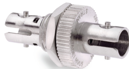
M83522/17-NY ST-ST Adapter